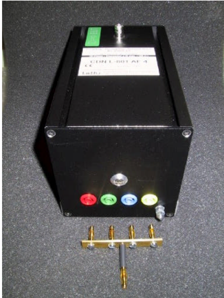
CDN, Daten 4 Leiter, 4 mm Laborbuchsen