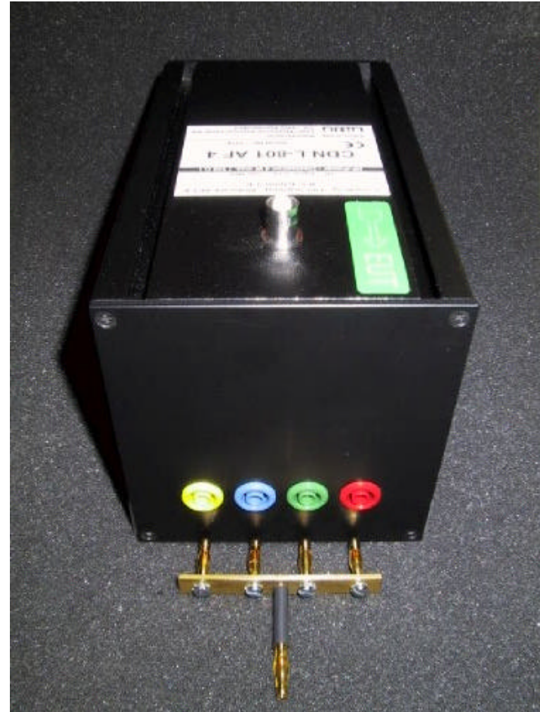
CDN Data 4 leads, 4 mm female connectors